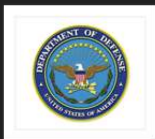
United States Department of Defense (DoD)