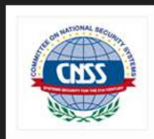
Committee on National Security Systems (CNSS)