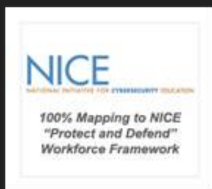
The National Initiative for Cybersecurity Education (NICE)