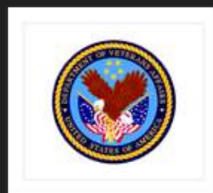
Department of Veterans Affairs